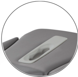
NEW: Ergomax Face Support